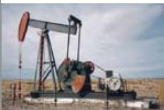
Oil Well Pumping Unit